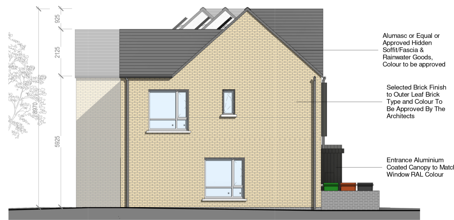
3 Block 5.5 - Side Elevation 1 1:100