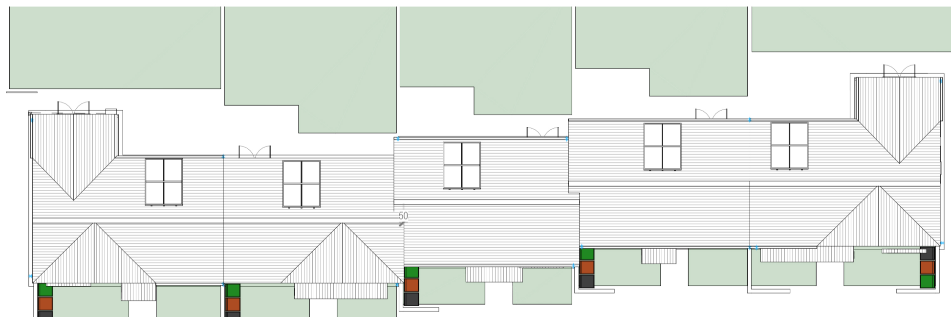
5 Block 5.5- Roof Plan 1:200