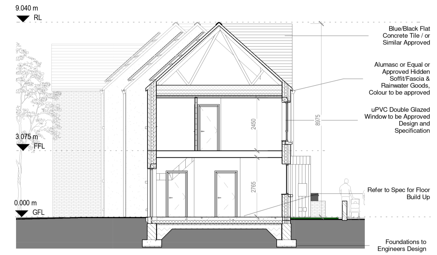
4 Block 5.5 - Section A-A 1:100