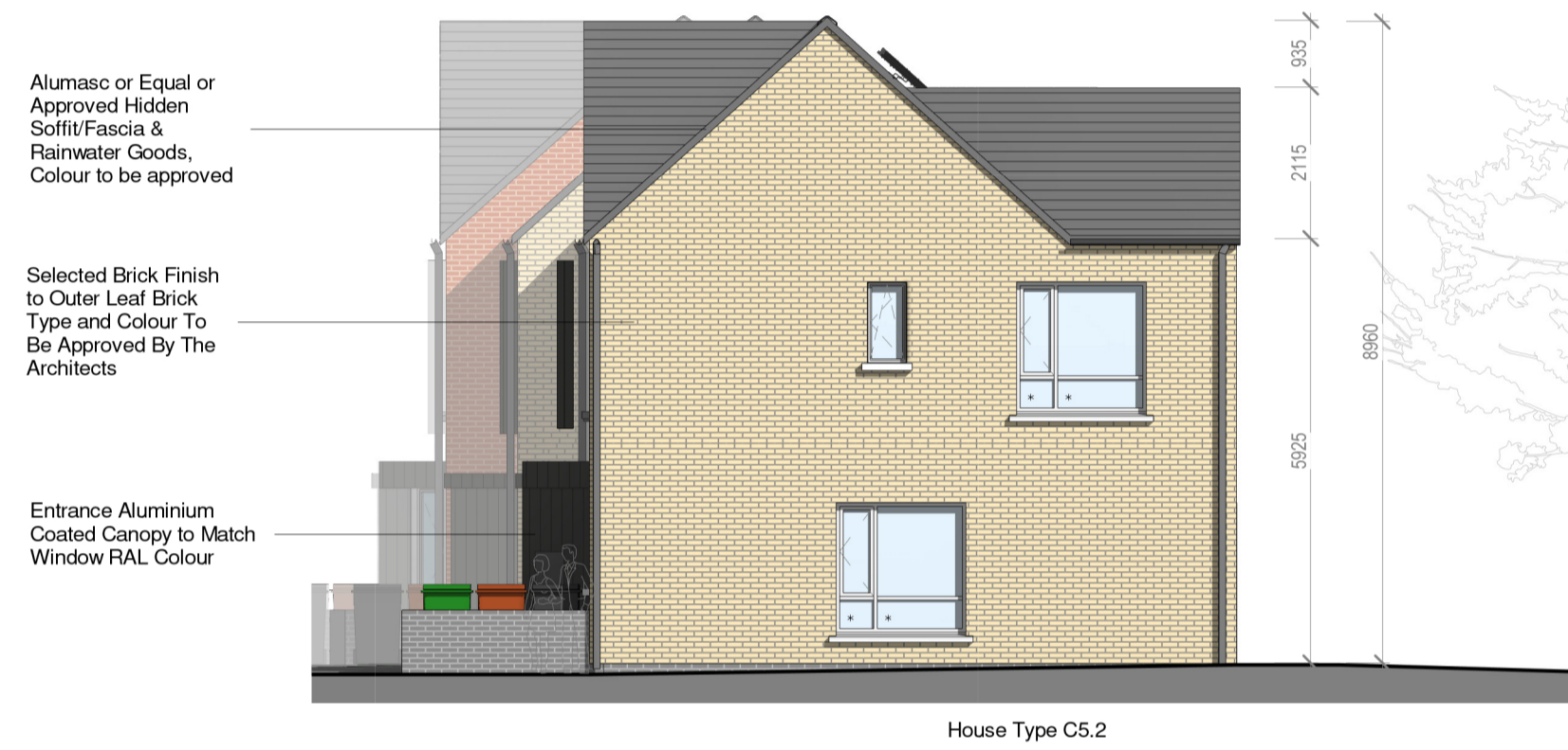
2 Block 5.5 - Side Elevation 2 1:100