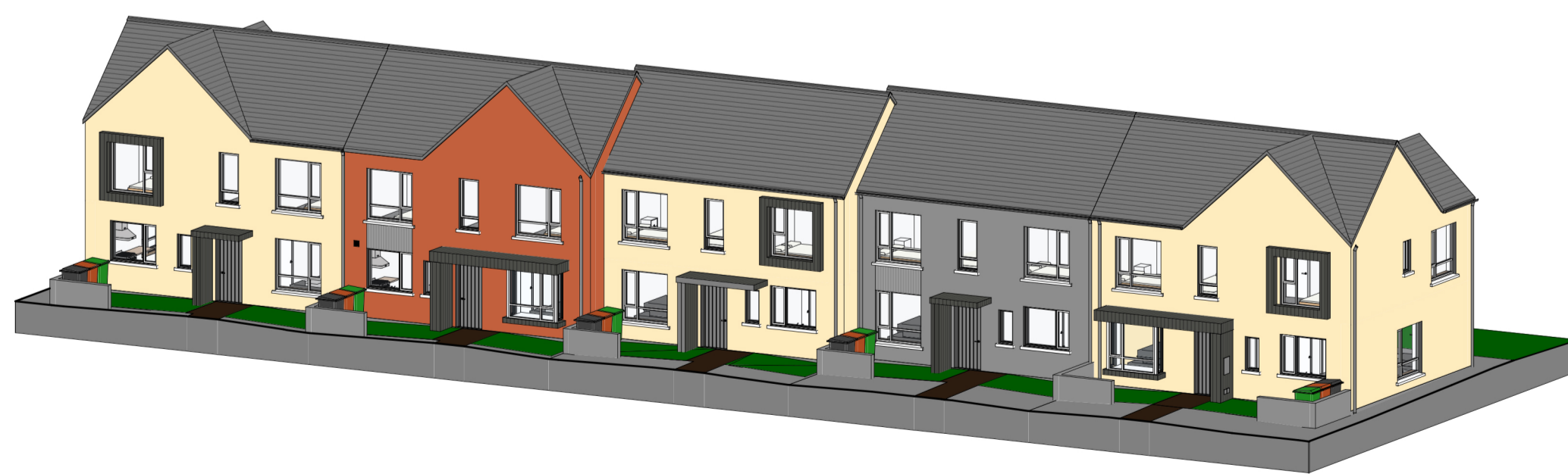
6 Block 5.5 - 3D View